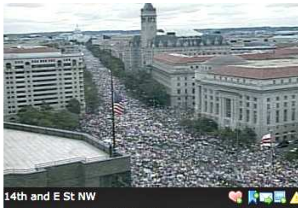
14th and E St NW Hundreds of thousands descend on Capitol

WND was at the scene to get crowd reaction and take photos of the protest.