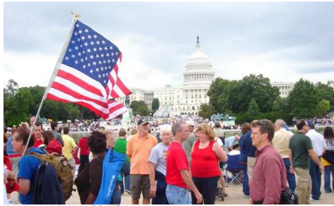
Live at the scene in Washington, D.C.

WND People Contact WND Who's Who at WND Customer Service Speakers and Talk Show Guests Columnists