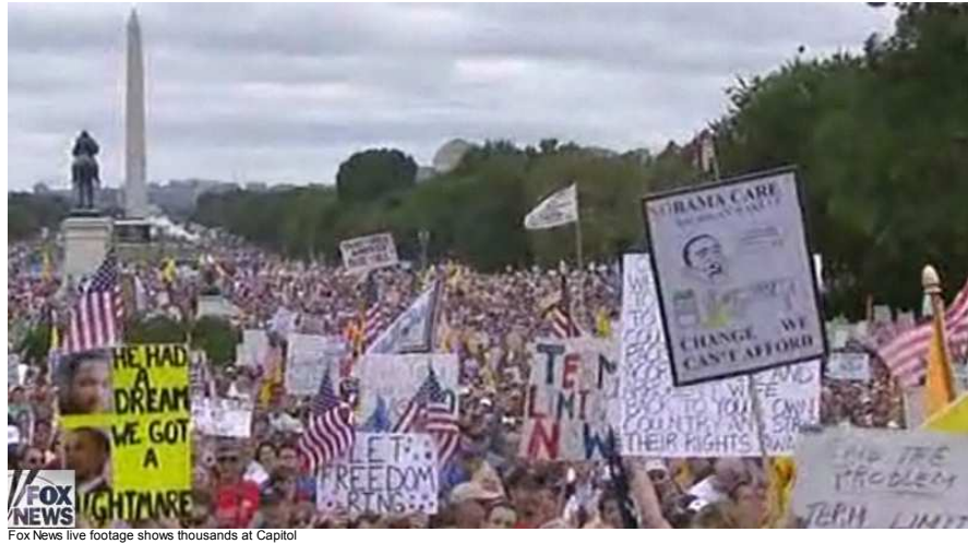
Fox News live footage shows thousands at Capitol

"My grandkids are going to be paying for this. It's going to cost too much money that we don't have," he said while marching with a wooden cane.